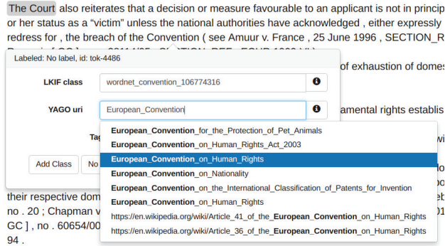
Fig. 2. The annotation of the entity Convention in LOAV.